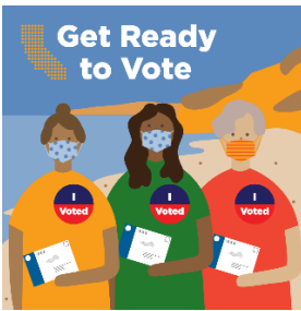
Group 2: Voting Options Series