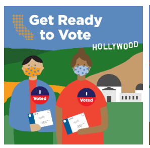
Group 1: California Series

Future of California Elections partnered with our designer to develop a custom set of graphics for this Presidential Election. The full collection is available on our <a href="Moogle Drive">Google Drive</a> and Facebook @FutureCAElect. Please email <a href="hello@futureofcaelections.org">hello@futureofcaelections.org</a> with any questions.