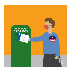
Group 3: "I Voted" Sticker Series

Stickers are available in the Google Folder in: English, Spanish, Armenian, Farsi, Japanese, Chinese, Tagalog, Korean, Russian, and Vietnamese. Email <a href="mailto:hello@futurecaelections.org">hello@futurecaelections.org</a> to request a new language.