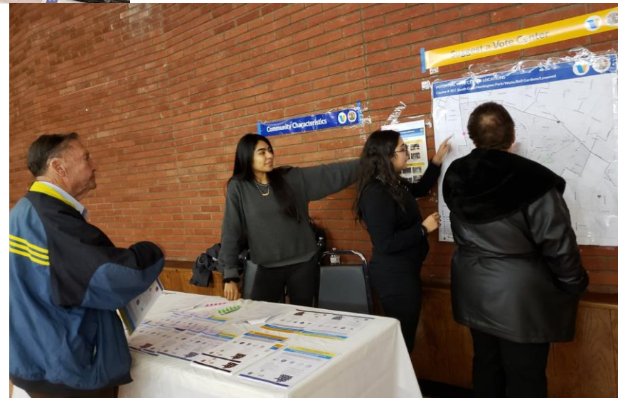
Southeast LA VCPP Meeting