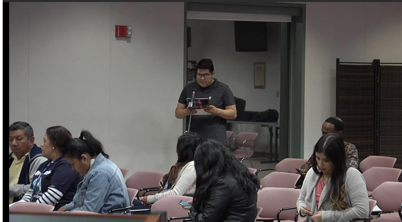
Lancaster Resident, First Generation Voter and CHIRLA member sharing public comment at the Lancaster EAP Public Hearing