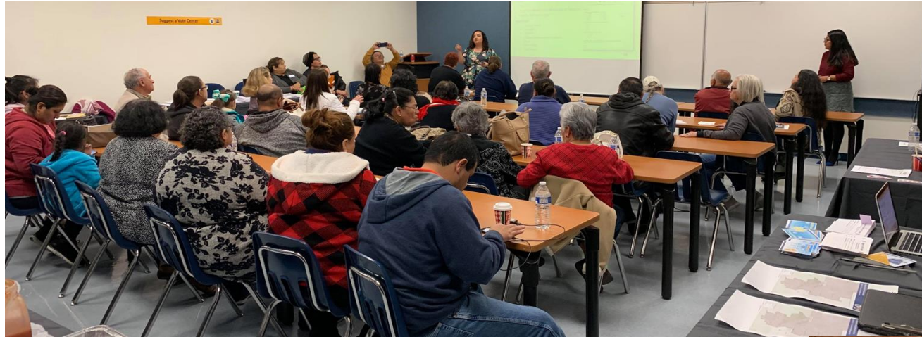
Lancaster VCPP Meeting