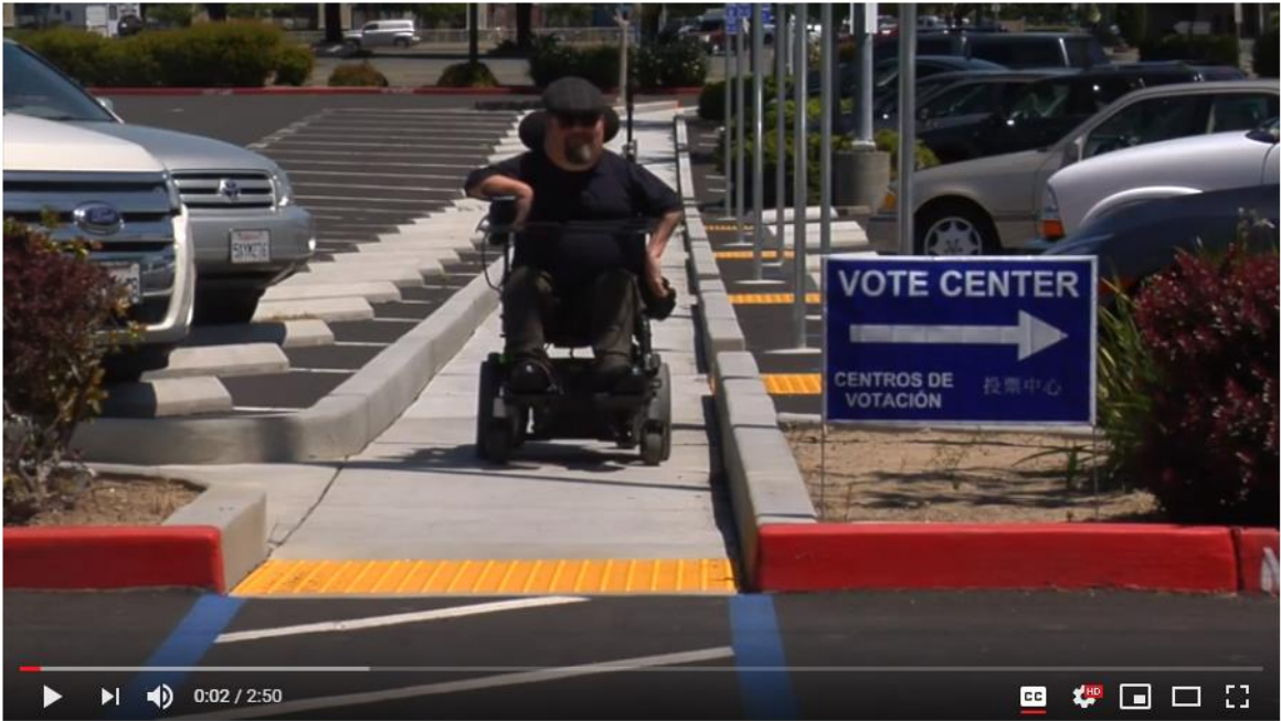
Vote Centers and Accessibility