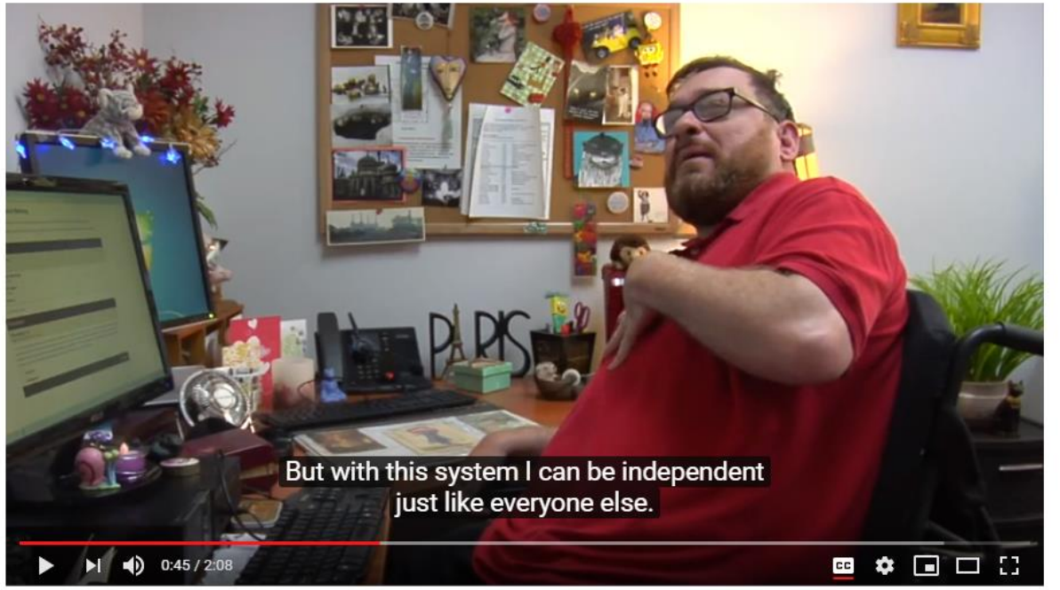
Accessible Vote by Mail for Voters with Disabilities