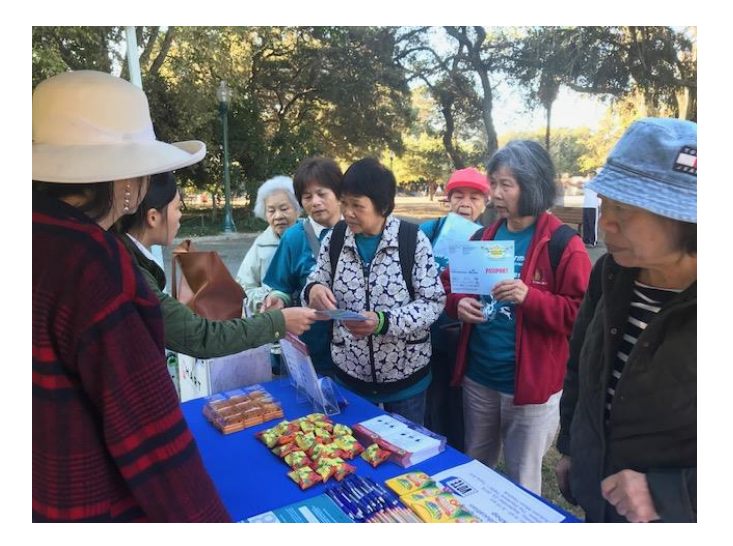
Table at community events