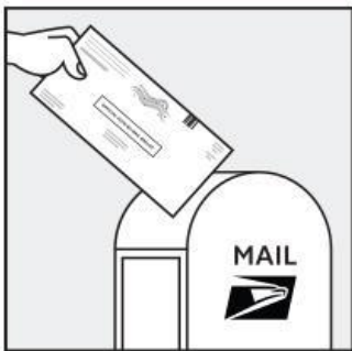
By Mail Center

All registered voters will receive their ballot in the mail a few weeks before an election. You will have 3 ways to return your ballot: