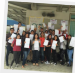
Students at Torrey High who registered to vote (Twitter @LATandVote)

One of the most depressing statistics of the Los Angeles primary elections in March was that only roughly 10 percent of registered voters participated.